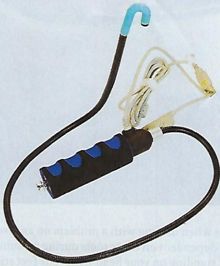
Borescope with fully articulating head

lines to HVAC systems. Many of these tools, now renamed inspection cameras, became very useful for aircraft inspection. Many of them had extensions that made it possible to access even the most remote parts of an aircraft. Initially, the cost was in the $100 to $200 price range. However, the cost of these units continues to decline even as their capabilities increase.