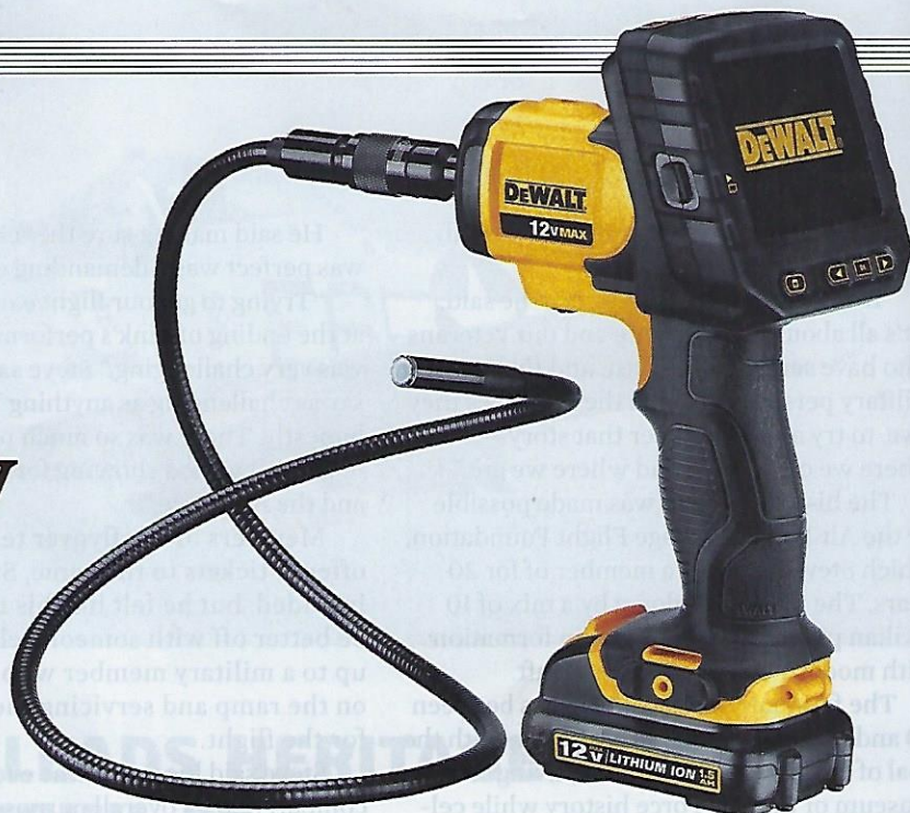
Digital borescope with camera and video capability

Early on, the borescope was considered a luxury. They were relatively expensive and could only be afforded in the most important of circumstances. The endoscope was the medical industry’s equivalent of the borescope. This device revolutionized the medical industry by allowing doctors to get a first-hand look inside of the human body without invasive surgery. Even though we had several rigid boscopes for inspecting cylinders, it really changed our perspective on the capability of these instruments the day that our local doctor brought his very expensive, high-quality endoscope from his office for us to use in inspecting the wing closeout on his Lancair IV-P. While there was much laughter and joking about the efficacy of this particular instrument transitioning its usefulness in both the human body and the workshop, it was our first exposure to an instrument that could turn corners, adjust lighting and focus, and