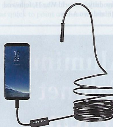
Smartphone borescope with wireless capability

extend far into the “bowels” of the aircraft wing. It provided an additional level of capability not possible before. Unfortunately, the cost of these tools at the time was something the average shop could not afford. We will admit, there were a few other “emergency” occasions when we asked to use the tool again. It wasn’t until many years later that the cost and capability of the borescope was really changed by the advent of digital technology.